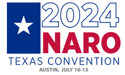
EXHIBIT SPACE, HOURS & SPECIFICATIONS