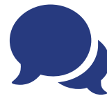
Exhibit information about your products & services directly to your target market on a person-to-person basis, in an informal atmosphere.

Estimated 400 attendees, including individual royalty owners, bank trust officers, institutional royalty trust managers, landmen, attorneys, professional mineral managers, & investors.